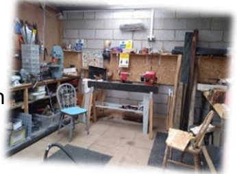
Not a Shed when no one there!

A Shed's sustainability and value lies in an inclusive atmosphere likened to a supportive band of brothers. With the inclusion of women in a Men's Shed it is family! A Shed is for a mix of people but commonly at some kind of loss (maybe hidden) that isolates.